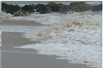
Wonderful Christchurch Harbour Views.